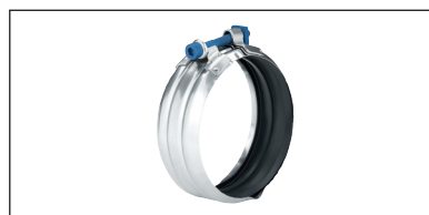
NORMACONNECT® DCS RAPID MSM

NORMACONNECT® DCS RAPID is part of a broad portfolio. Discover more!