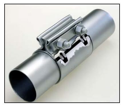
Inner sleeve provides tight seal with patented dual tongue-&groove feature

For joining high performance exhaust components